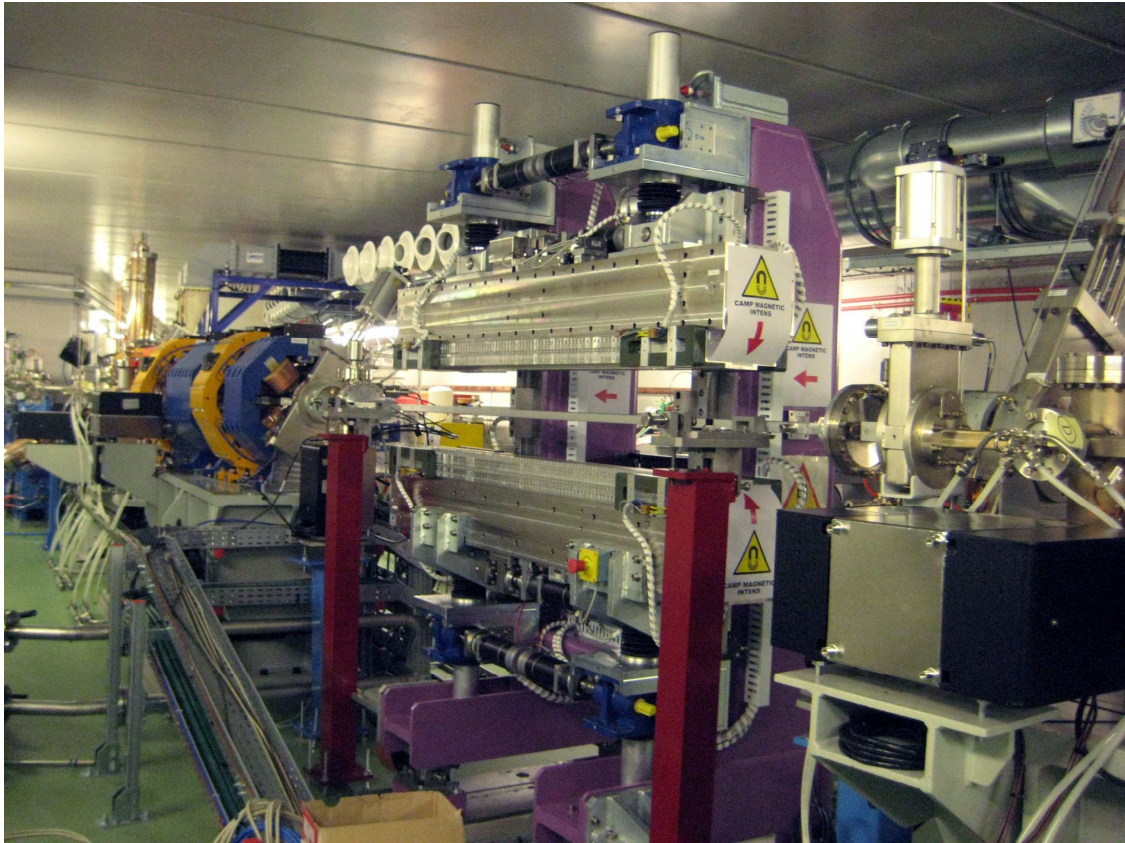
Figure 2. This picture shows the first Insertion Device installed in the ALBA Storage Ring. It is an APPLE-II Undulator, with a period of 71 mm which will give light to BL29-BOREAS.